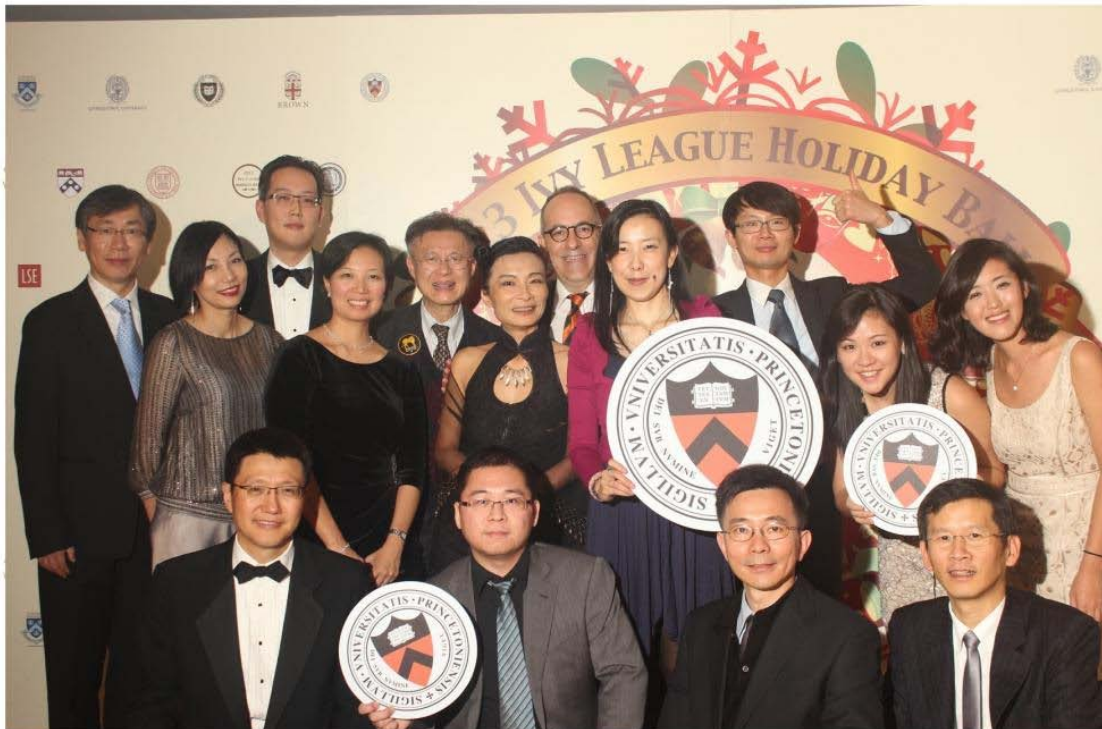
Photo below from a holiday 2013 gathering in Taiwan. Welcome 2014 !!! Tiger Table Capture with Princeton University Shield and Motto @ 2013 Year End Ivy League Holiday Ball~~!

Receptions following the Gathering in Honor of Princeton's 20th President Christopher Eisgruber '83